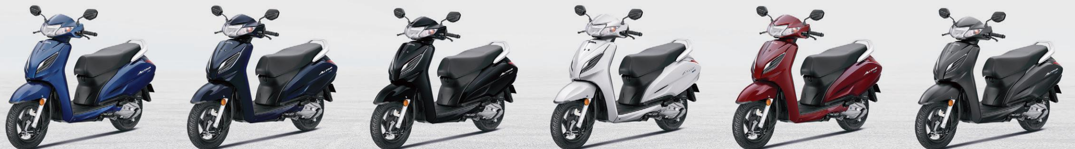
Decent Blue Metallic Pearl Siren Blue Black Pearl Precious White Rebel Red Metallic Mat Axis Grey Metallic

•+The technical specifications and design of the vehicle may vary according to the requirements and conditions without any notice • Activa meets Bharat Stage VI norms • Product shown in the picture may vary from actual product available in the market • Accessories shown in the picture are not part of standard equipment • The technical specifications mentioned are for Smart Key variant • All features may not be part of all variants • #Source: Cumulative sales figure of Brand Activa from June 2001 to June 2023. • **Conditions apply